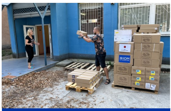
UNLOADING OF CLOTHING AID FROM PALETTS TO THE TEMPORARY WAREHOUSE IN NITRA.