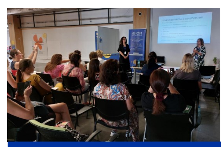
THE PARTICIPANTS IN BRATISLAVA ALSO APPRECIATED INFORMATION ABOUT FREE COUNSELLING AND SERVICES OF THE IOM MIC THEY COULD BENEFIT FROM.

The participants learnt how to look for a job in a safe way using web portals, how to interact with work agencies, how to identify the "red flags" that could indicate risky job advertisements, what basics of Slovak labor law and types of employment contracts are, as well as what their rights as employees in Slovakia are.