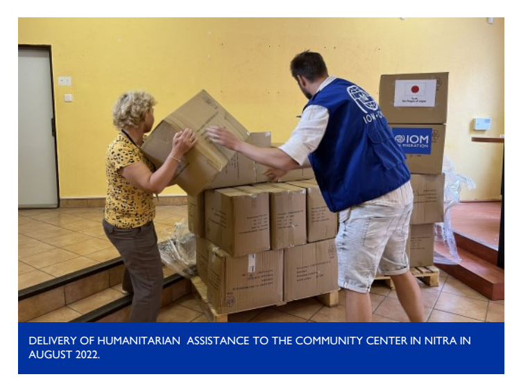
IOM is continuing to provide humanitarian aid to this center in Nitra. On 16 August 2022, IOM delivered 7 palletes with clothing that were unloaded with help of employees of the City of Nitra and Ukrainian volunteers at the temporary warehouse residing in the High School of Gastronomy in Nitra.

On 8 August 2022, IOM delivered to their temporary warehouse in the High School of Gastronomy in Nitra 1,000 hygiene kits for women, children and men. Furthermore, IOM also delivered clothing donations: 1,600 slippers. Thanks to IOM donations, the centre can secure daily care of these women, children and other people in need.