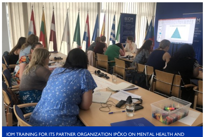
IOM TRAINING FOR ITS PARTNER ORGANIZATION IPČKO ON MENTAL HEALTH AND PSYCHOSOCIAL SUPPORT IN EMERGENCIES IN AUGUST 2022.

On the last day of the training, the professionals learned how to use this knowledge in practice. During their field trip to the Gabcikovo Accommodation Centre, they experienced the environment and conditions of hundreds of people that fled Ukraine and found temporary shelter in Slovakia.